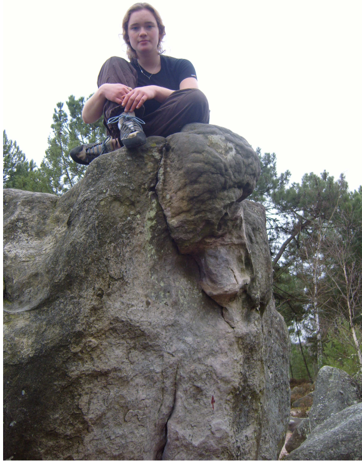
Picture 8 - Queen of the Castle