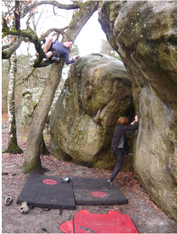
Picture 4 - Filming the action