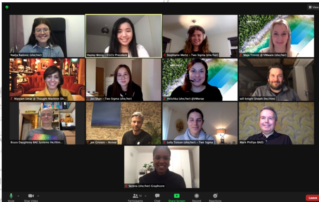
The panellists for the Faces of Engineering online event

The panel was attended by ten panellists from the Engineering industry, ranging from Aerospace to Software companies. The remote nature of the event seemed to attract a greater number of panellists than our prior in-person panels, likely due to its convenience. The increased uptake was unexpected, and led to a slightly larger panel of speakers than initially planned - many companies opting to send two representatives each. This change is something to be taken into account for future remote events of this nature, with a more staggered approach to contacting industry partners asking for their attendance.