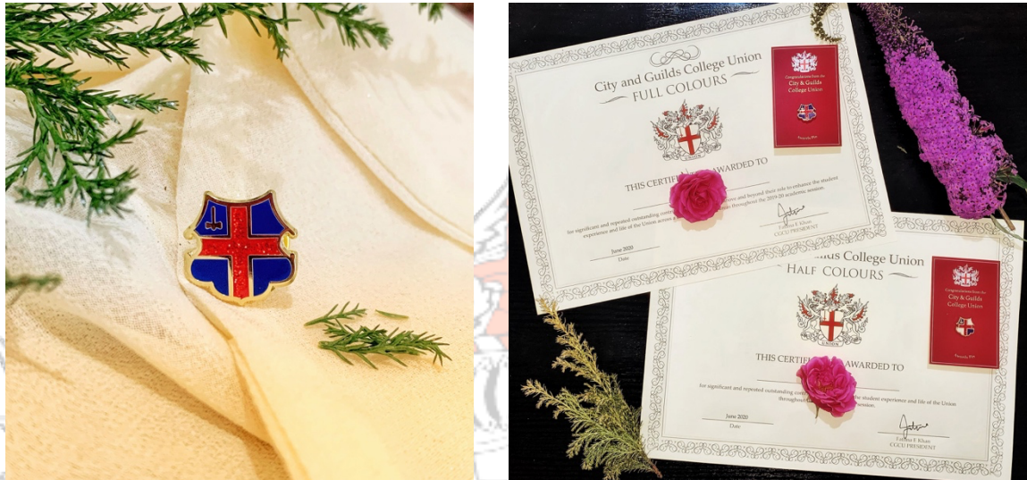
One of the pins and the certificates for the CGCU Colours Awards

The CGCU Colours Awards is done annually around June to reflect on the work of the students who have went above and beyond for their community, department or society. We have publicised nominations until the 18 th of June, in which we'll then be awarding the different colours awards (half-colours, full-colours, President's Award) on an absolute terms basis so that all volunteers are judged only on their individual effort and merit and not in comparison to others.