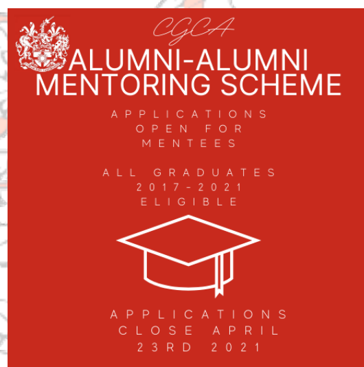
CGCA alumni mentoring scheme promotional post

As described in the previous report, the objective of this scheme is to connect recent graduates (<5 years since graduation) with more senior graduates (>5 years since graduation) for the opportunity for mentees to receive specialist careers advice from more experience graduates who were once in their position.